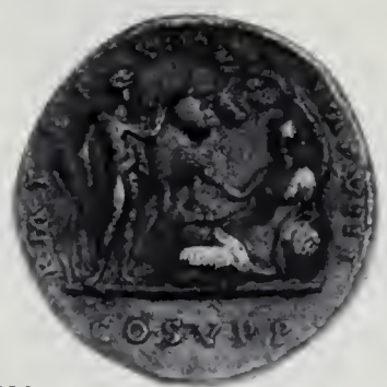
Lot No. 2261

2261 Æ 38. Laureate bust r. with aegis. Rv. Tellus reclining l.; youthful male standing to l. with two bulls. Gnecchi Pl.83.10/84.8. Holes drilled in the edge at twelve and six o'clock. Very Good/Fine.